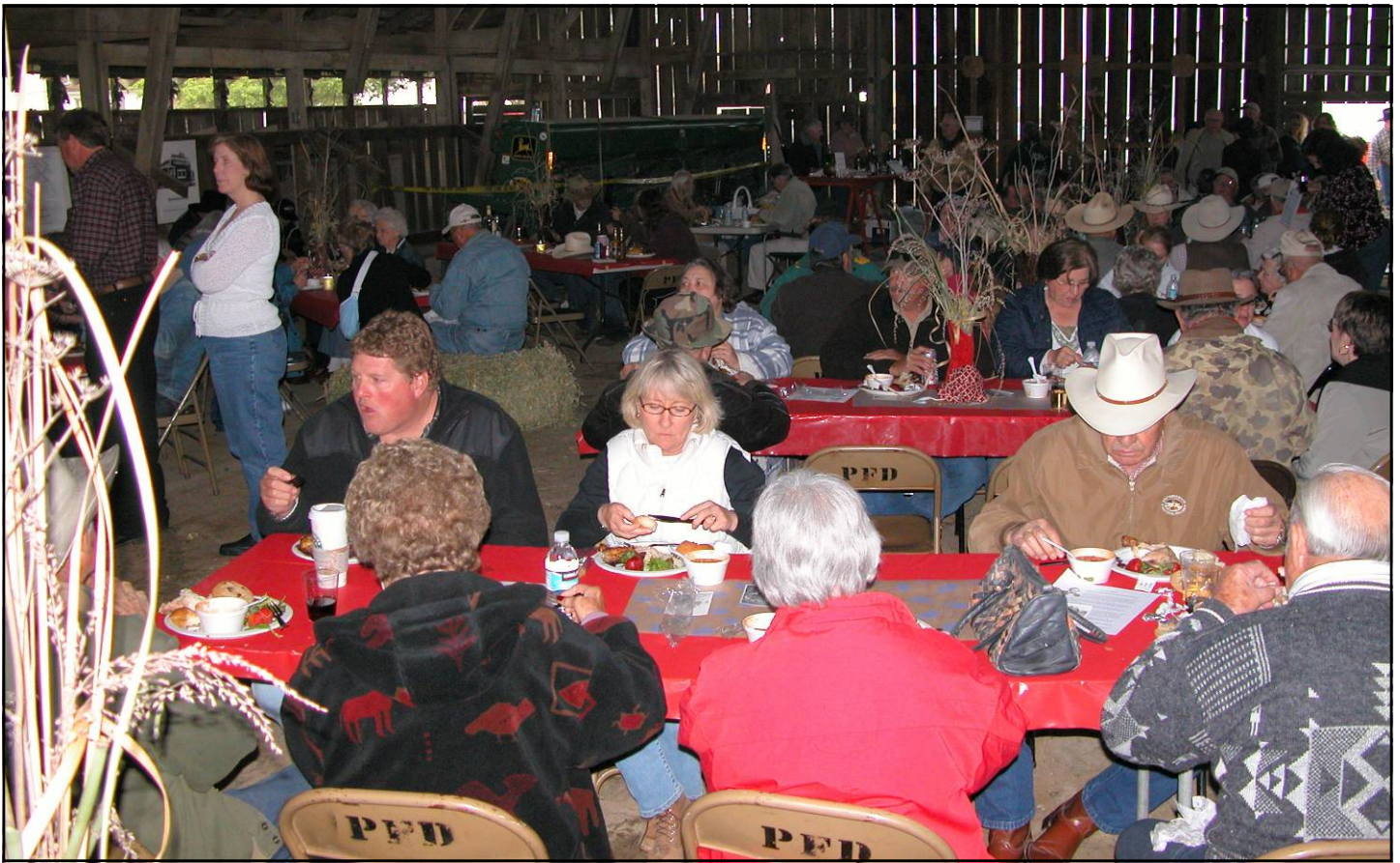
Last years BBQ in the Houk Barn with people chowing down to some really good grub for a good cause.

The Historical Society is preparing for what may be our fourth and last West Side Horse Trail Ride. Next year will be Patterson's 100 Year Jubilee celebration spread out over the summer months which will preempt a Trail Ride for next year.